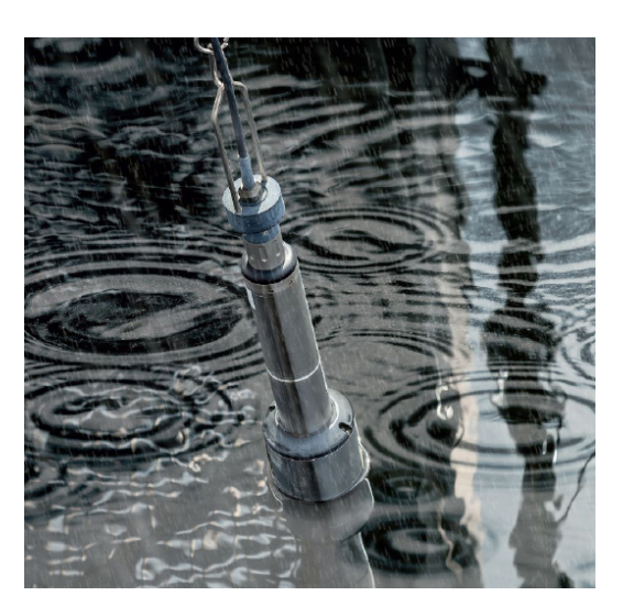
Figure 1: Sludge level sensor IFL 700 IQ

The danger of sludge drift can affect wastewater treatment plants of any size. Small plants are less able to absorb hydraulic peaks. In larger plants, the volume of sludge drift would have enormous consequences, both for the receiving water and for the operation of the plant.