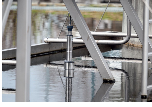
Figure 2: Typical location of the IFL 700 IQ on a scraper bridge in the secondary clarifier

The sensor can be connected to the controller not only via cable but alternatively also wirelessly via two MIQ/WL PS radio modules (Figure 3). This allows the sensor to be installed at the ideal location on the scraper bridge. A radio connection of two or more sensors with one additional radio module each is possible and thus allows the monitoring of further basins.